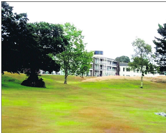
STUNNING VIEWS: The fairways on the 18th hole of the Kernow Course and the four-star hotel at St Mellion International Resort