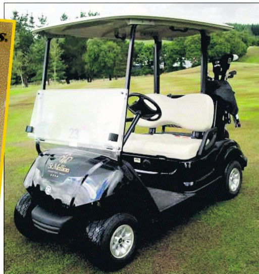
EASY RIDER: One of the many golf buggies available for hire at St Mellion International Resort